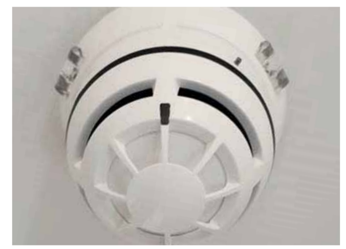
Smoke Alarm With Sounder and Flashing Light

A new wireless, cloud-based fire alarm system with in-built sounder (alarm) or light, ideal for people who are hard of hearing or deaf, is being tested at one of our properties.